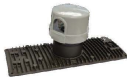
LF3-PK Photocell Kit for LF3