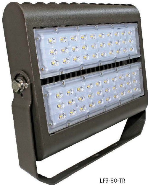
LF3-80-TR LF3-100-TR LF3-150-TR